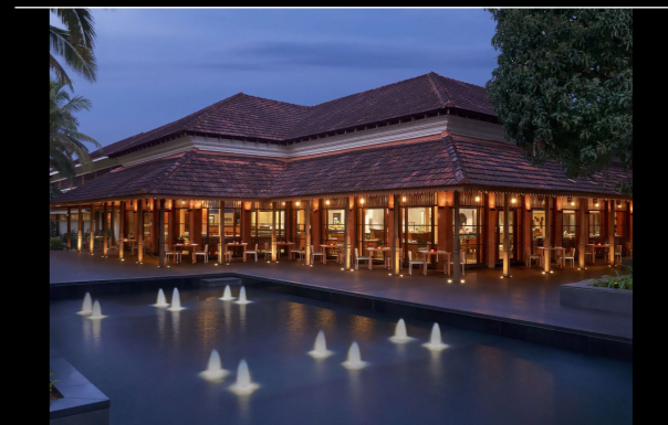
ALILA RESORT (Goa)