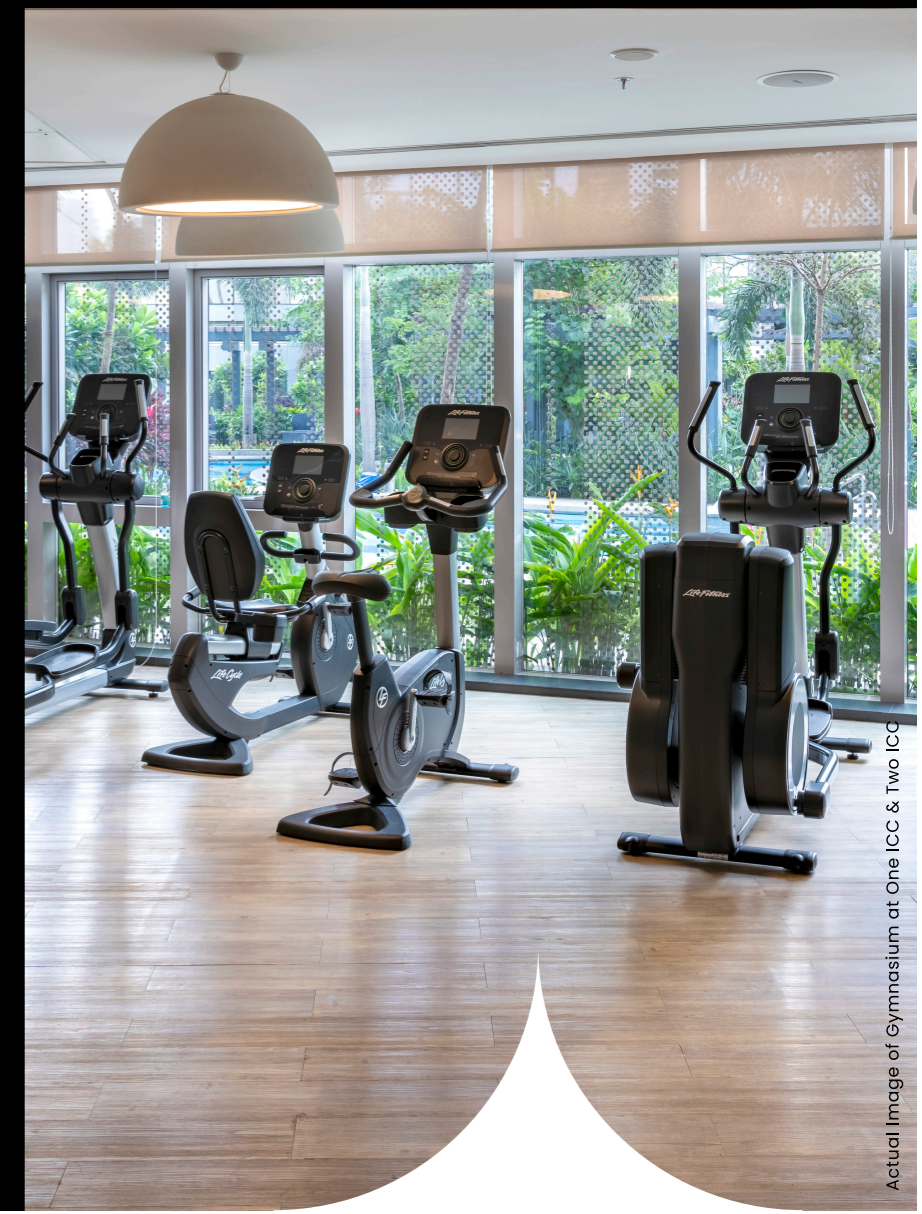
Actual Image of Gymnasium at One ICC & Two ICC