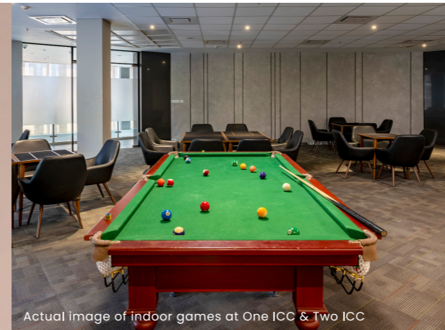
Actual Image of indoor games at One ICC & Two ICC