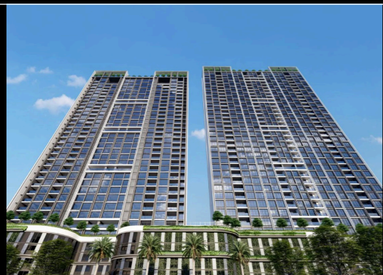
MODERN VIVAREA (Mahalaxmi)