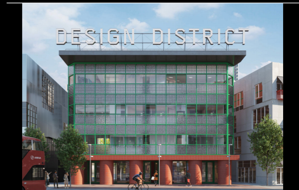
GREENWICH DESIGN DISTRICT (London)