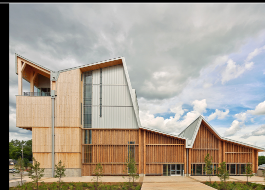
TIMBERLANDS CENTER (Arkansas)

The structural force behind Anthony Timberlands Center (Arkansas), Greenwich Design District (London), Tata Aveza (Mumbai), Alila Resort (Goa), Whitby Wood is a London-based engineering studio known for elegant complexity. Their work merges material intelligence with sustainability and performance, delivering long-span structures, asymmetrical towers and adaptive systems that endure.