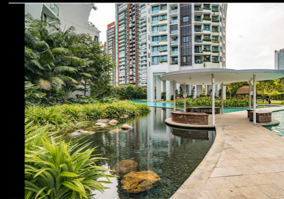
THE CREST (Singapore)