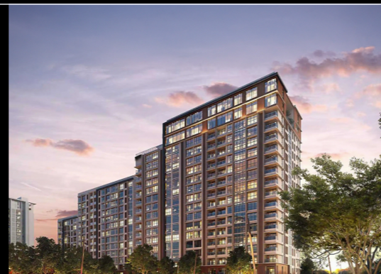
GODREJ TREES (Vikhroli)