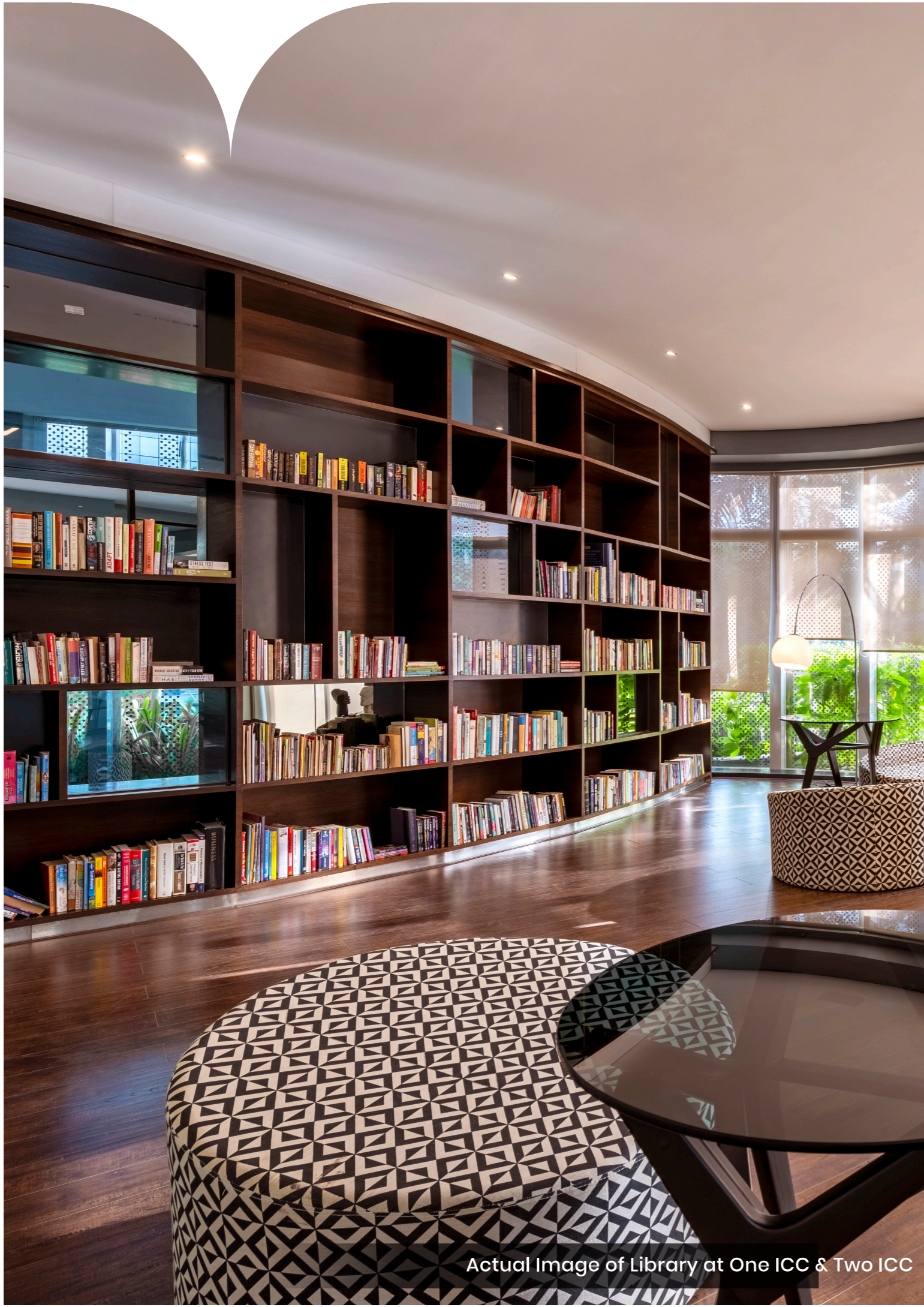
Actual Image of Library at One ICC & Two ICC