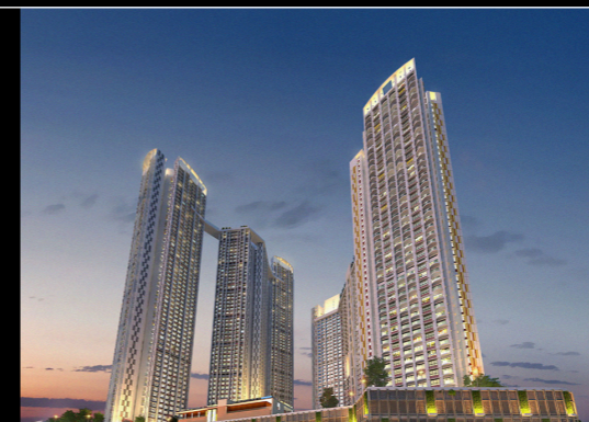
TATA AVEZA (Mumbai)