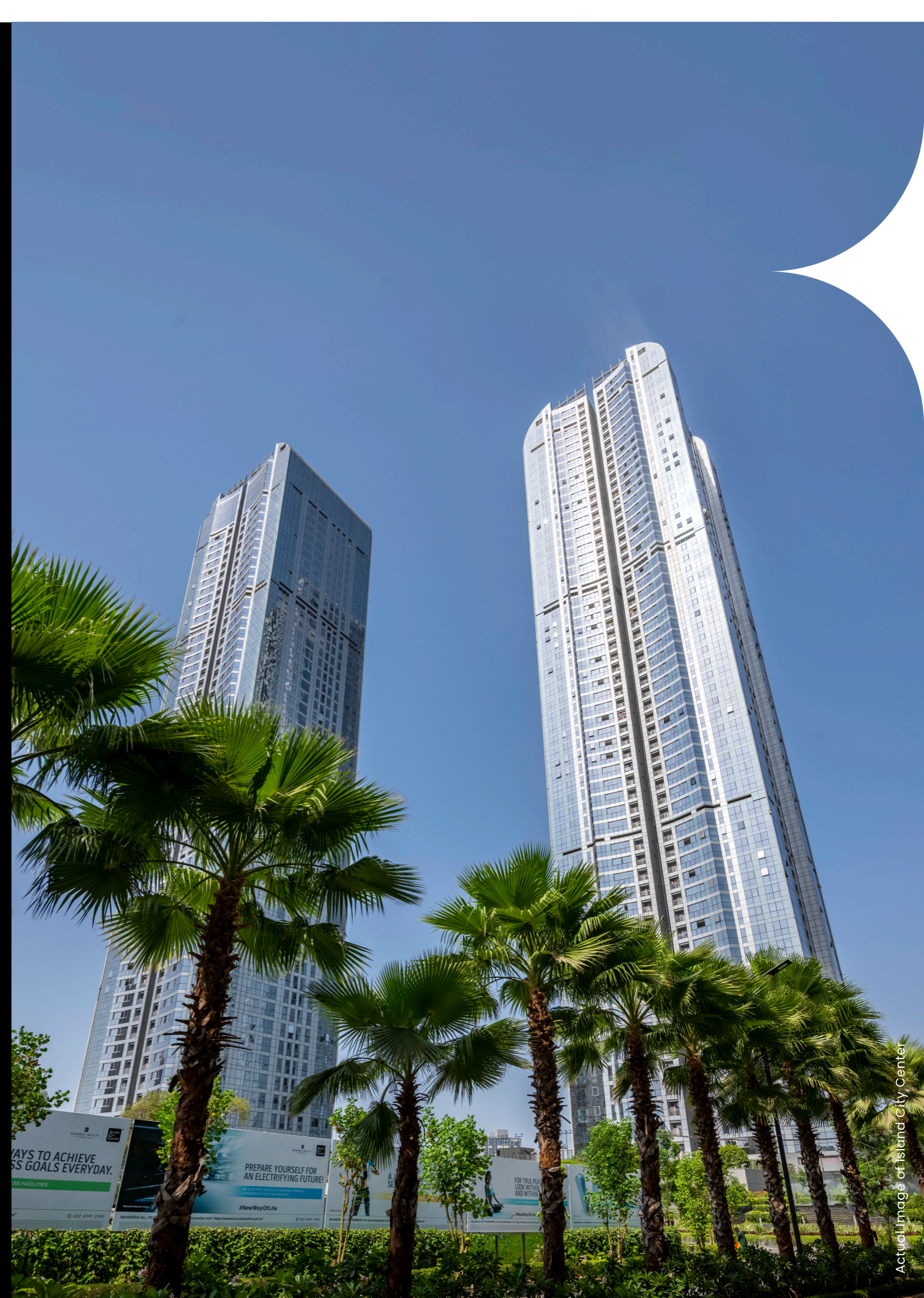
Actual Image of Island City Center

One of the largest available internationally-resonating developments in the city center, and possibly its most gorgeous and prestigious one at that. With most of the region now built out or fragmented across smaller redevelopment plots, integrated land holdings of this magnitude are increasingly rare. It is a contiguous, master-planned land parcel, delivered with infrastructure, scale, and spatial clarity that few city-core developments can match.