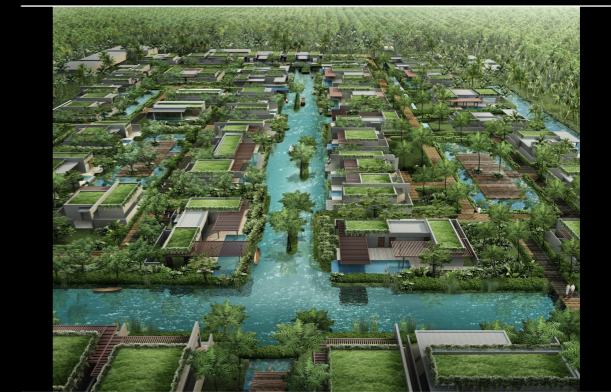
ADIRA RESORT (India)