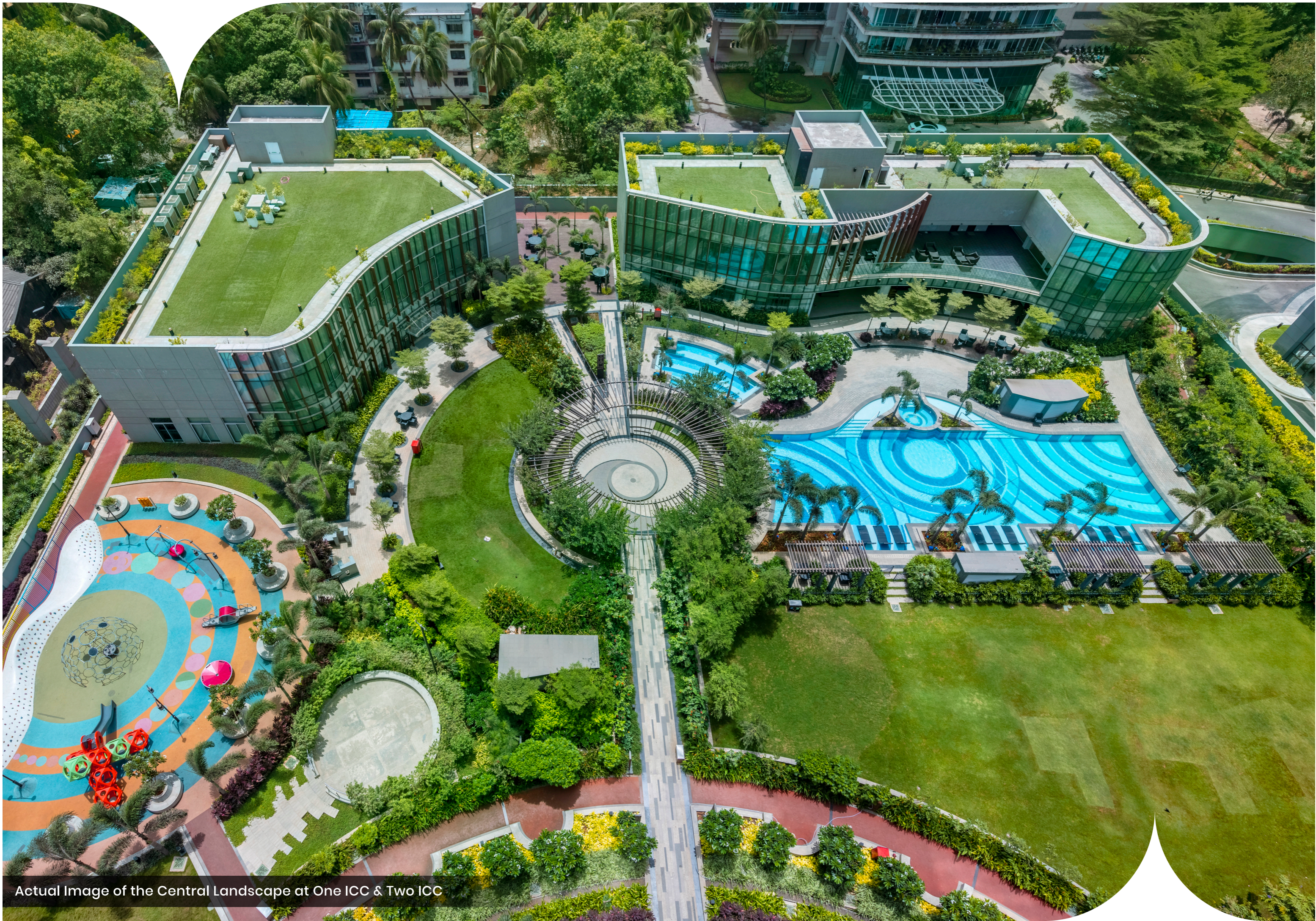
Actual Image of the Central Landscape at One ICC & Two ICC