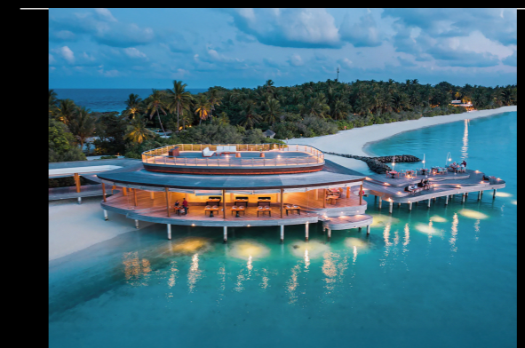
SIRRU FEN FUSHI (Maldives)