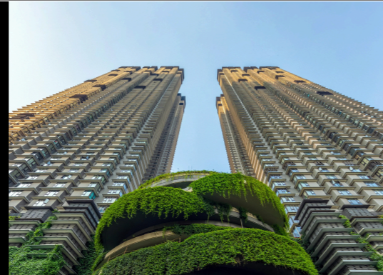
LODHA PARK (Lower Parel)