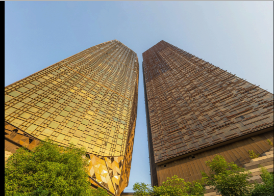
TRUMP TOWER (Worli)

The architect and blueprint masterminds for the Trump Tower (Worli), Lodha Park (Lower Parel), Modern Vivarea (Mahalaxmi), Godrej Trees (Vikhroli), JW Marriott Sahar (Andheri) and Deltin (Goa), Kapadia Associates is among Mumbai's most accomplished architectural studios. Their portfolio spans hospitality, high-rises and urban master-planning, shaped by spatial discipline and formal restraint. Known for designing efficiently at scale, they bring clarity to dense footprints and balance between privacy and openness.