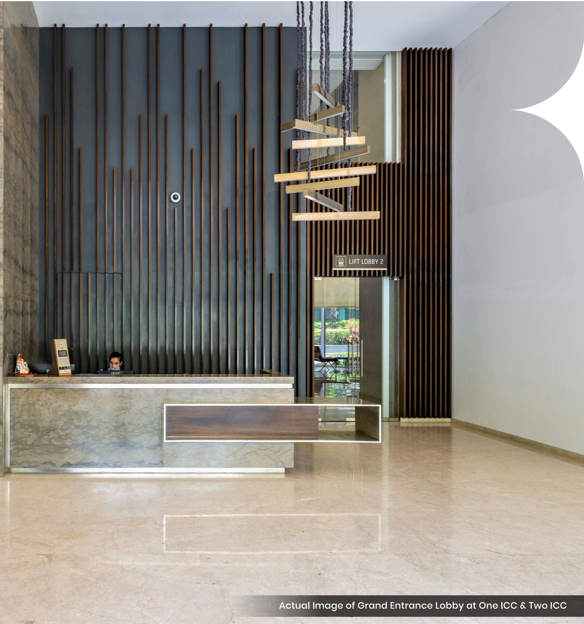
Actual Image of Grand Entrance Lobby at One ICC & Two ICC