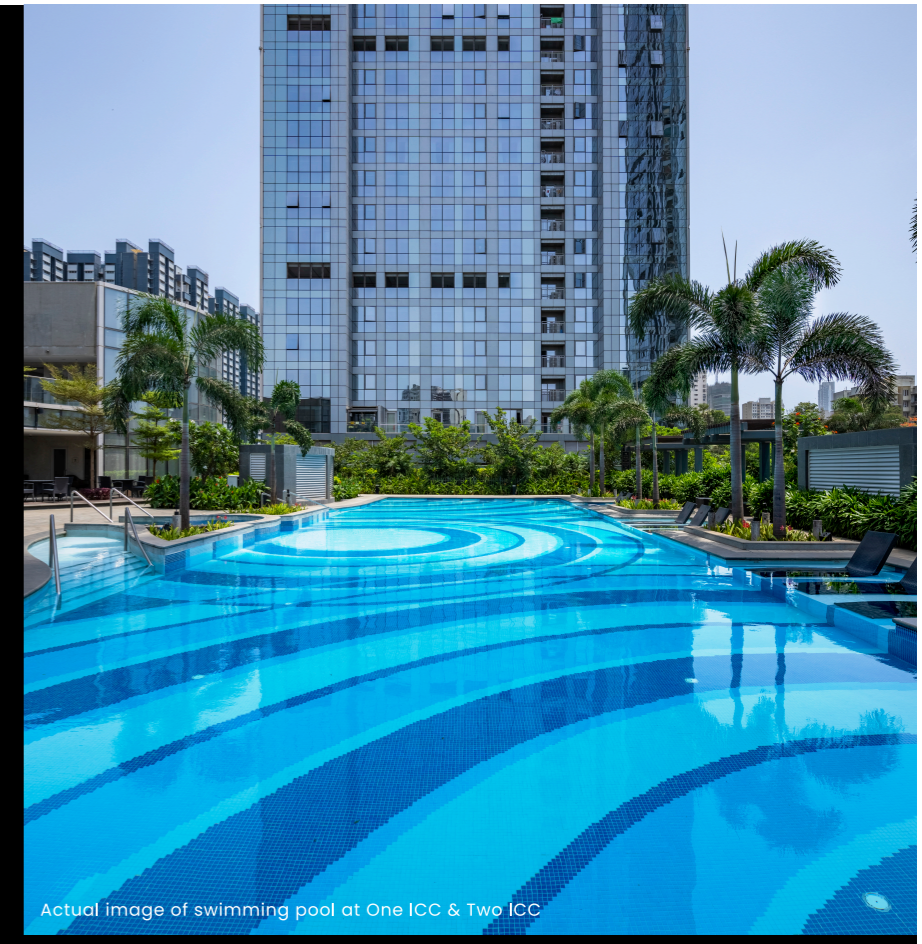
Actual Image of swimming pool at One ICC & Two ICC